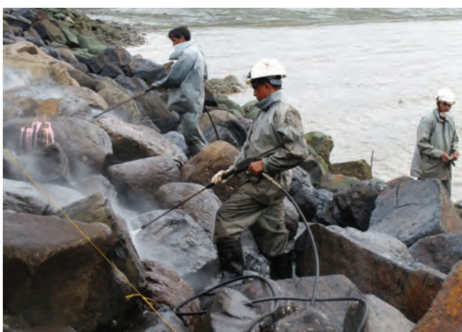
▲ Figure 32: Cleaning of rip-rap using high pressure washers.