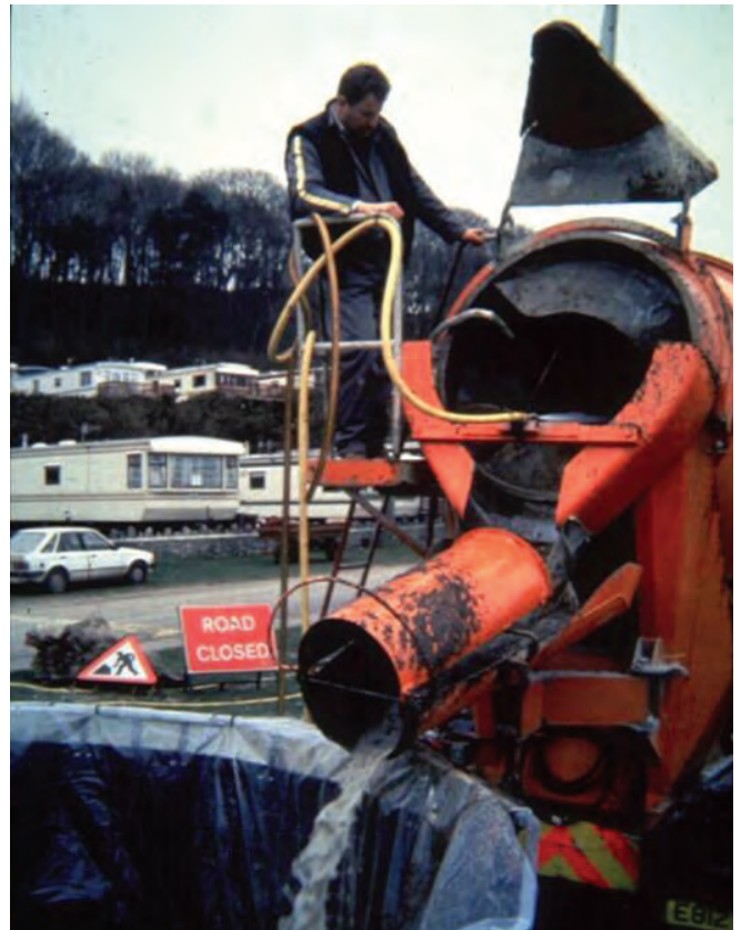
▲ Figure 24: Effluent released from a concrete mixer truck after washing pebbles and small cobbles.

Thirty to sixty minutes' flushing is usually sufficient to release most oil from a given batch. Although only lightly