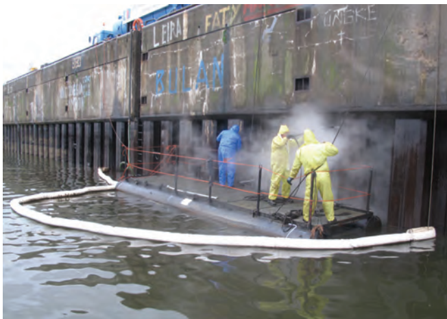
▲ Figure 30: Oiled pilings and dock quay being pressure washed from a small raft. Released oil is collected in the sorbent boom.