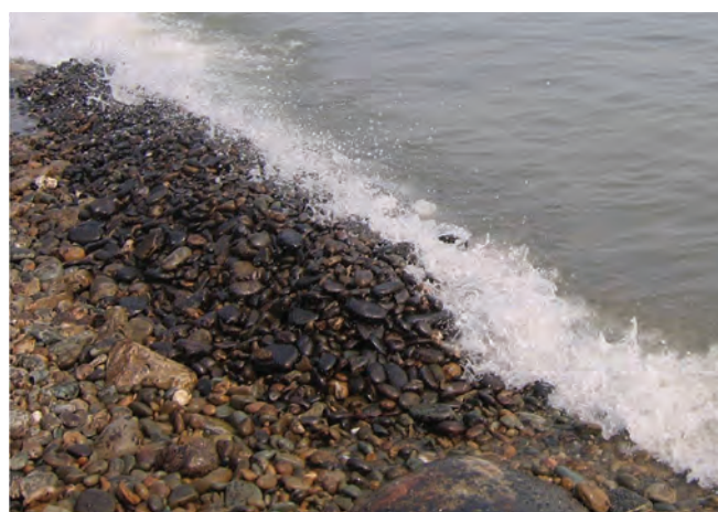
▲ Figure 20: Oiled cobbles transferred to the surf zone for washing.

‘clay-oil flocculation’ or ‘oil-mineral aggregation’. These flocculates or aggregates are close to neutrally buoyant and disperse widely into the sea.