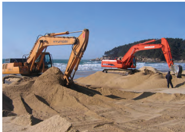
▲ Figure 18: Lightly contaminated sand is moved to the intertidal surf zone for washing on subsequent tides.