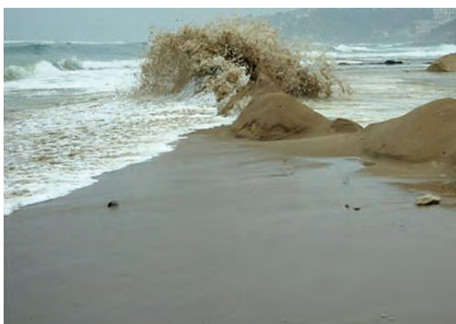
▲ Figure 19: Piled sand is washed by the incoming tide to remobilise trapped oil.