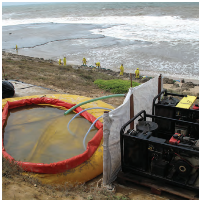
▲ Figure 22: Pressure cleaning a rock ledge in a remote location. Seawater was pumped to the temporary storage tank to be used by the adjacent high pressure machines.