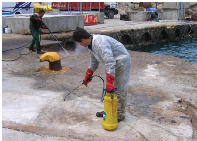
▲ Figure 23: A chemical shoreline cleaner applied to an oil stain followed by pressure washing.