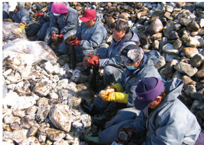
▲ Figure 28: Volunteers wiping oiled rocks with rags.