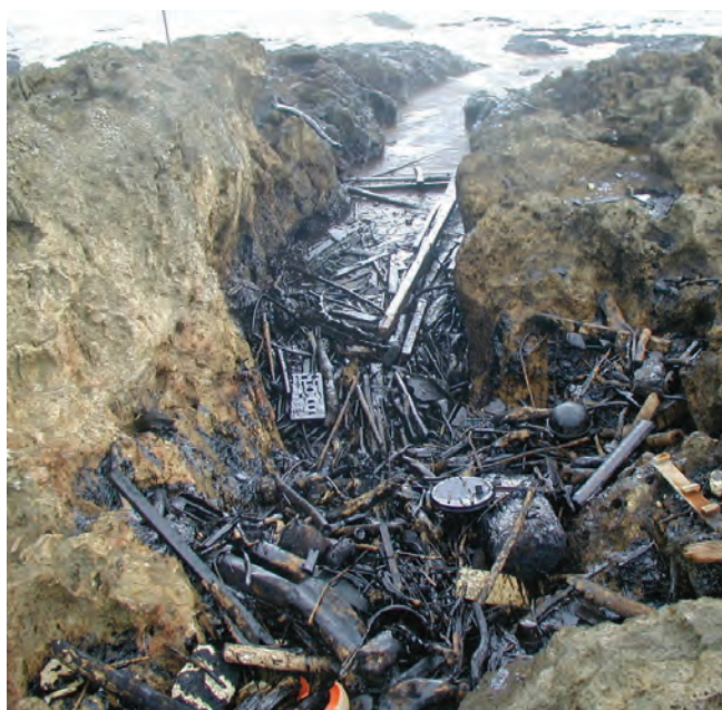
▲ Figure 34: Oil and oiled debris will collect in pools and crevices on rocky shorelines, requiring significant manual clean-up.