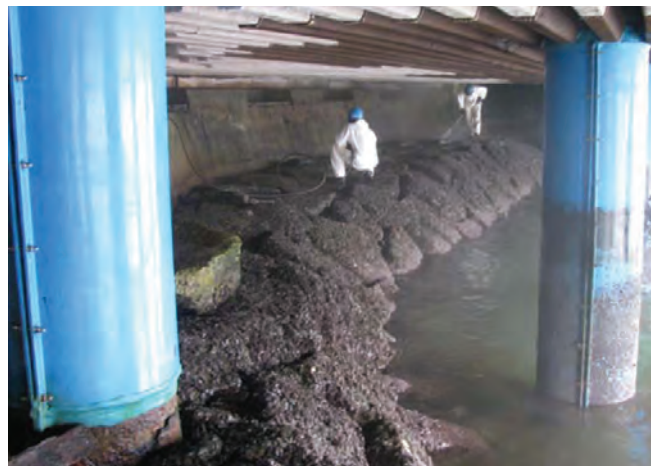
▲ Figure 31: Access underneath wharves may be difficult and dangerous for clean-up crews due to the lack of headroom and ventilation.